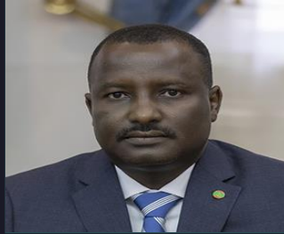
H.E. Mr. Mohamed Ould Soueidatt Minister of Public Service and Labour Islamic Republic of Mauritania

Day One - Sunday, May 4, 2025 from 14:10 to 14:20