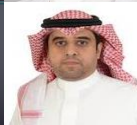
Eng. Ibrahim bin Abdulqader Al Abu Issa Deputy Governor of the Supreme Authority for Industrial Security